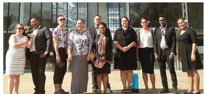
2018 Legal Policy Champions outside the Australian High Court

Congratulations to this year's Policy Champions on the successful completion of the 2018 Pacific Legal Policy Champions Program. This year, officers from PNG, Samoa, Solomon Islands, Tuvalu and Vanuatu joined the Australian Attorney-General's Department (AAGD) from 12-23 March 2018 in Canberra, Australia, for this fun, interactive and challenging policy development program.