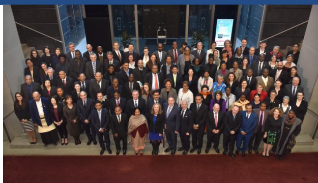
Participants of the 4 th Commonwealth Red Cross Red Crescent Conference on IHL, Canberra, 20 July 2015

Across the four days, participants shared experiences and perspectives on current issues related to IHL and humanitarian action, with specific sessions on the changing nature of conflict, addressing sexual violence, ensuring respect for health care, protection of cultural property, and domestic implementation of IHL, among many others.