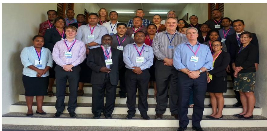
PILON CORRUPTION AND PROCEEDS OF CRIME Working Group Meeting 6 - 8 October, 2015 Suva, Fiji.