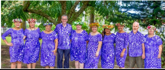
Cook Islands Crown Law Office Staff 2018